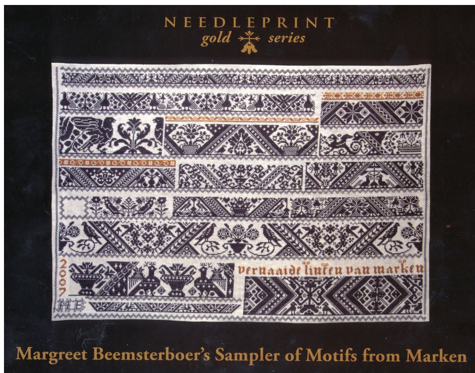
Margreet Beemsterboer's Sampler of Motifs from Marken

I no longer have any patterns available for sale, but you can purchase them directly from Needleprint.