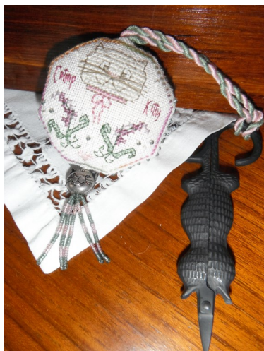
Catnip Kitty Fob by 'The Sweetheart Tree'

Thread: Simply Shaker Sampler Thread - Dungarees by 'The Gentle Art' $5.50 per skein