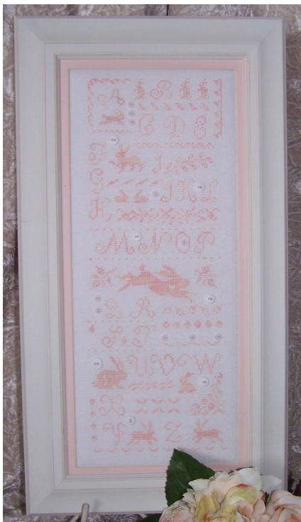
The Rabbit Sampler by 'JBW Designs'

Thread: Silk 'n Colors - Sophie's Strawberry by 'The Thread Gatherer' $13.50 per skein