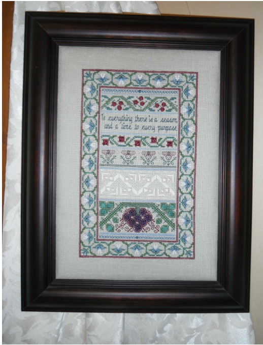
Grape Delight by 'Periwinkle Promises'