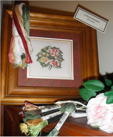
A Floral Bouquet by 'JBW Designs'