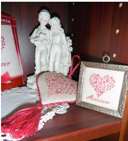
French Country ~ Armour by 'JBW Designs'