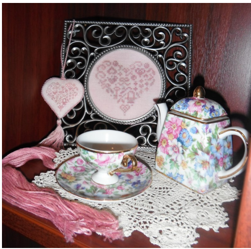
French Country ~ Armour by 'JBW Designs'

The next design has been stitched in two different colourways and also stitched over one thread and over two threads