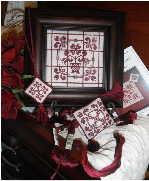
Tiny Quaker Potted Flower & Fob by 'The Sweetheart Tree'