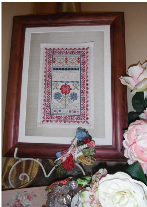
Garnet Sampler by 'Periwinkle Promises'

Note: This colour has been discontinued but lots of other lovely overdyed colours available