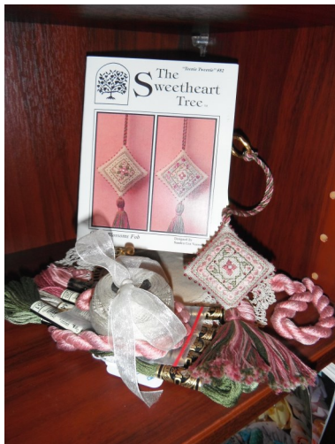
Cherry Blossoms Fob by 'The Sweetheart Tree'

Some of the many needlework pieces I had on display are pictured. All of these designs are available for purchase. Please contact me if you like one or two sent to you -