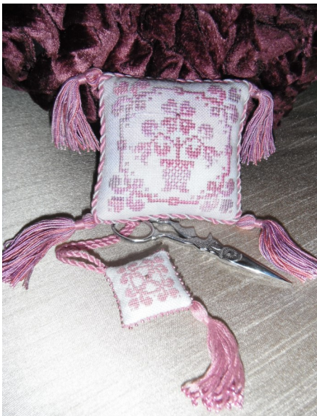
Tiny Quaker Potted Flower & Fob by 'The Sweetheart Tree'

The same design as above but stitched with a different thread type and colour -