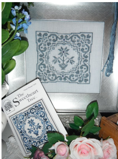
La Fleur by 'The Sweetheart Tree'

Design (including embellishment): $25.00