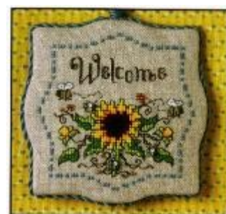
SWT:TK 065 Sunflowers And Bumblebees Welcome

SWT:MB - Mounting Boards: In a package are two Custom-Cut mounting boards. The shape of these is that of the 'Welcome' series, making the finishing of this series quick and easy. The shape of these mounting boards is also suitable for an earlier Christmas design by Sandie - JOY. $11.00