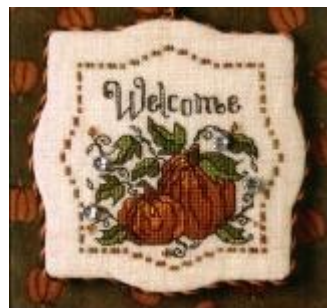
SWT:TK 064 Autumn Pumpkins Welcome

SWT:TK 065 - Sunflowers & Bumblebees Welcome: The third in the four-part mini 'Welcome' series. Circling a colossal sunflower are a duo of buzzing bumblebees intent on gathering summer honey. This kit contains 32 count 'Lambswool' linen, DMC threads, shiny silver flower beads & other beads. $42.00