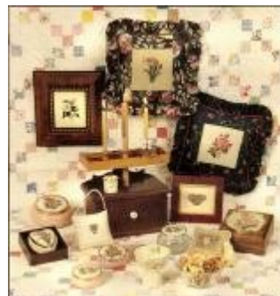
HC : L007 Stylized Florals