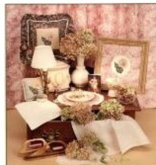
HC : L010 Hearty Hydrangea