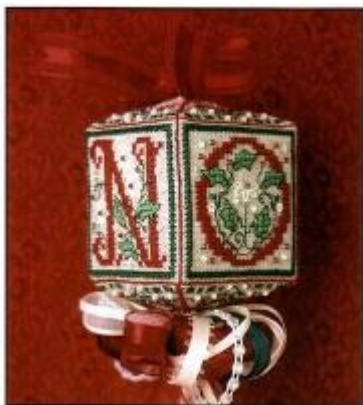
SWT:Q 004 NOEL Quadrielle