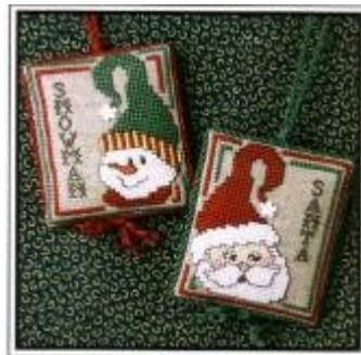
SWT:TT 155 Snowman & Santa Ornaments