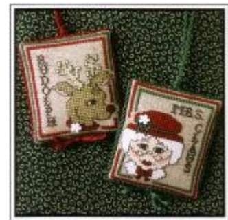
SET:T 156 Rudolph & Mrs. Claus Ornaments

SWT:TK 064 - Autumn Pumpkins Welcome: This Teenie Kit is one in a four-part mini-series. This design features two beautifully shaded field pumpkins and their leafy vines. A great Autumn welcome. This kit contains 32 count 'Lambswool' linen, DMC & ThreadworX overdyed threads, shiny silver flower beads and Mill Hill beads. $42.00