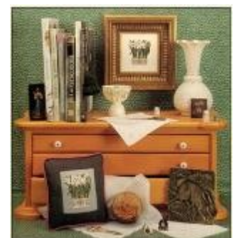
HC : L014 Narcissus — Paperwhites