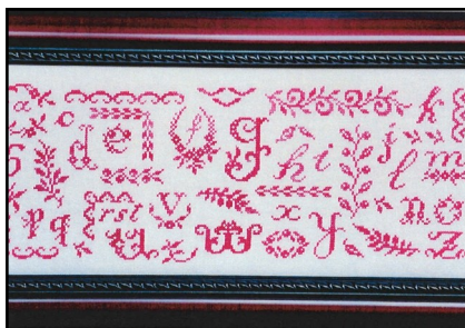
Le Petite Lettres