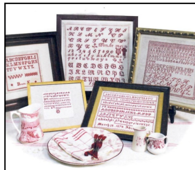
A Collection of Antique Red Samplers