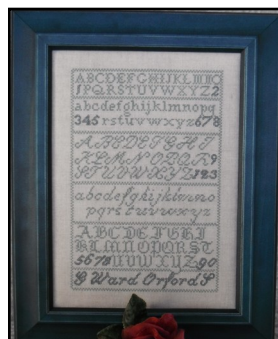
The Orford Sampler