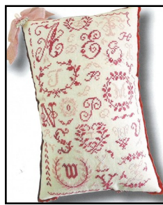
Fleur de Noel