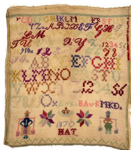
A Little Dutch Sampler