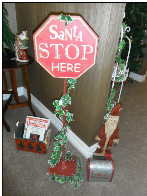
The Tableware / Décor tables -

To follow are some pics of the various displays.