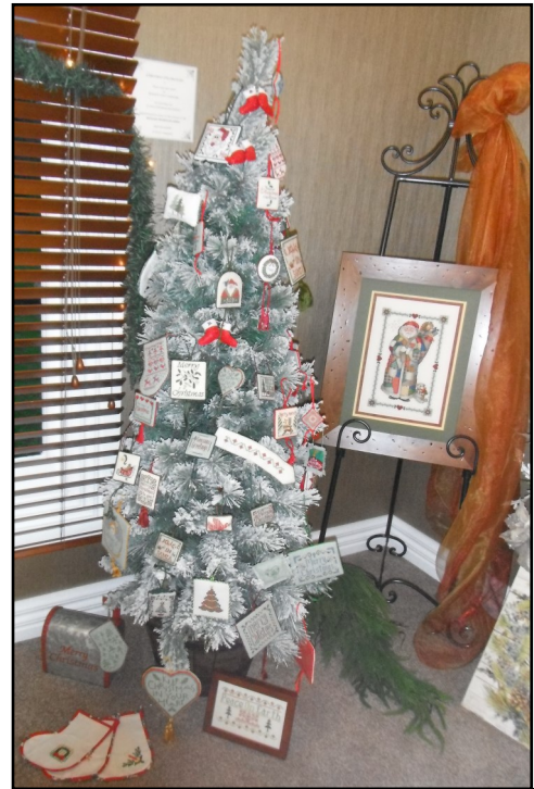
Pictured above is one of two Christmas trees decorated with the hand-stitched ornaments worked by many friends of 'Heirlooms'

To date, total donations for the orphanage amounts to $1,120.00. Awesome!