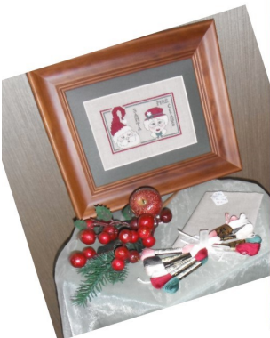
Mr. & Mrs. Claus

Design Title: Snowman & Santa Design Code: SWT:T 155 Design Title: Rudolph & Mrs. Claus Design Code: SWT:T 156 Price: $25.00 each