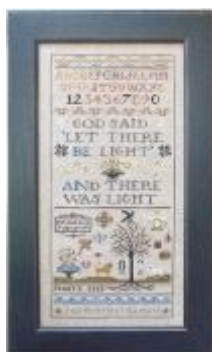
DESIGN - SP:JB-CREATE Jenny Bean's Creation Sampler $ 24.50