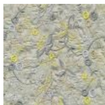
FINISHING FABRIC L'Aumoniere