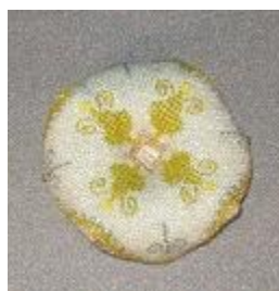
FRC:LAT L'Aumoniere Tuffet $ 31.50