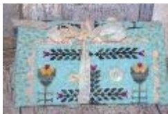
DESIGN - TTG:MEMORY La Fleur Memory Keeper $ 17.50