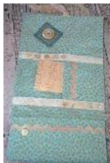
DESIGN - TTG:MEMORY La Fleur Memory Keeper (Inside when opened)