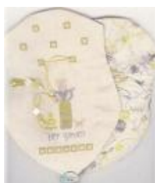
FRC:LAP L'Aumoniere Needle Pouch $65.00