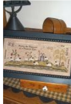
DESIGN - CHES:LULU Lulu's Flock $ 21.50