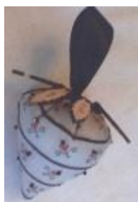
FRC:BW The Berry Words $ 59.00

Kits: By choice, I do not usually have many kits available, but I loved the ones featured below as the finishing fabrics in the kits are just fabulous! These kits are by Pat Cherry & Peggy Tipton of Fern Ridge Collections . These girls are good friends of Cece of The Thread Gatherer and often, Cece, Giulia and myself get together for a meal when we are at Nashville.