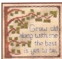
ED:GROW Grow Old With Me

ED:HEART - Celtic Heart: A mini kit. Chart, over dyed thread (purples) & an antique silver heart charm. $26.00