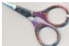
A petite pair of scissors with a floral pattern shaft & finger holes DD:SC 027 - $35.00