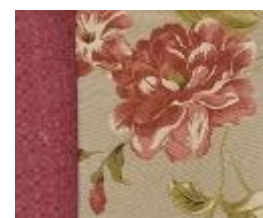
FABRICS Autumn Etui

Designs: The following are a couple of new designs (that is, new for Heirlooms) by Elizabeth's Designs that I purchased at Nashville. The other newer designs all sold during the Needlework Exhibition weekend.