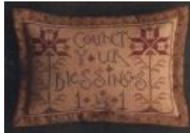
DESIGN - LADDA:COUNT Count Your Blessings $ 15.00