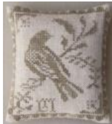
DESIGN - LADDA:YELLOW Yellow Bird $ 15.00