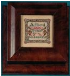
KIT - HC:K 086 Afford Your Passions $ 60.00