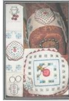
DESIGN - NASH:CS-G Garden Cushion Accessory $ 31.00