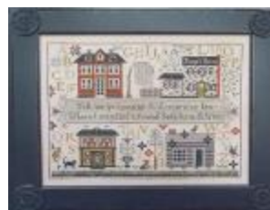
DESIGN - SP:JB-FRIEND Jenny Bean's Friendship Sampler $ 24.50