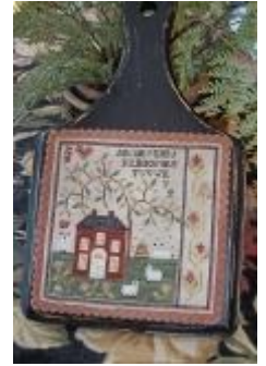
DESIGN - CHES:SCAR Scarlett's Summer Sampler $ 21.50