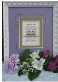
KIT - SB:BLOOM Friends Bloom $ 36.50