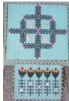
DESIGN - TTG:BOX LA Fleur Box & Pin Keep $ 17.50