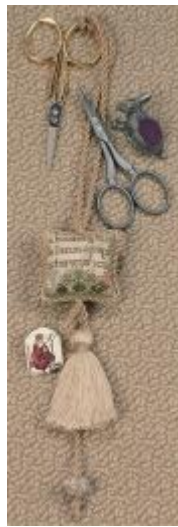
KIT - HC:K 131 Z - Sampler Fob $ 60.00