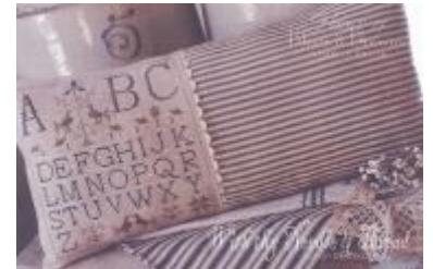
DESIGN - NOR:CS 082 House of Blues & Browns $ 21.50

More designs from other designers that were purchased at the Nashville Trade Show are to be featured over the next few months