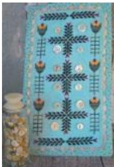
DESIGN - TTG:MEMORY La Fleur Memory Keeper (Cover when opened)