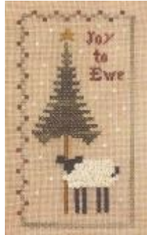
KIT - CHES:JOY Joy to Ewe $ 30.00