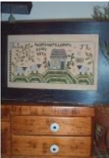
DESIGN - CHES:THREE Three Sheep Sampler $ 21.50