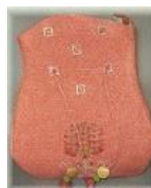
FRC:AEP Autumn Etui $ 99.50