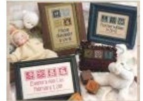
DESIGN - LZK 152 Oh Baby! $ 21.50