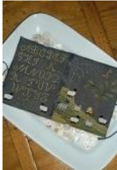
DESIGN - CHES:HILL Hillside Sheep Needlebook $ 21.50