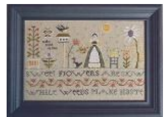
DESIGN - SP:WEED Weeds Make Haste $ 21.50