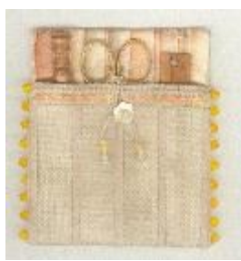
FRC:BBP Bee Blossom Pocket $ 56.50