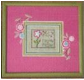
DESIGN & EMBELLISHMENT - Limited Edition SB:FP Flower Power $ 18.00