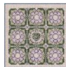
ED:HEART Celtic Heart