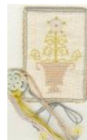
FRC:LAN L'Aumoniere Needlebook $ 49.50