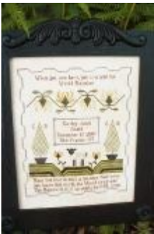
DESIGN - CHES:BIRTH Birth Sampler $ 21.50