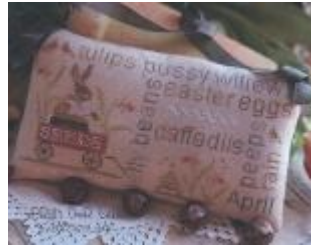
DESIGN - NOR:CS 080 April Word Play $ 20.00