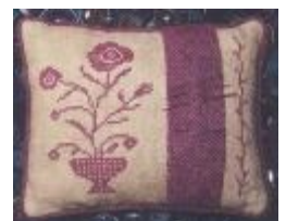
DESIGN - NASH:PPT Taby's Needle Cushion $ 24.50