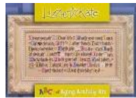
KIT - LZK 145 ABC's of Aging Artfully $ 58.50