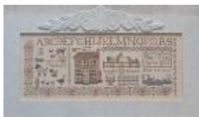
DESIGN - SP:JB-SPRING Jenny Bean's Gentle Spring Sampler $ 24.50