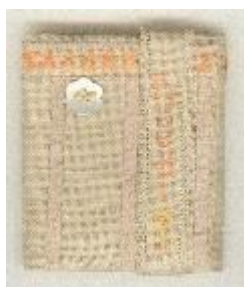
FRC:BBN Bee Blossom Needlebook $ 49.50