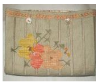
FRC:BBPU Bee Blossom Purse $ 75.00