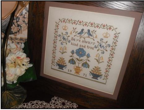
WMN:KIND - Kind and True

Here are a few pics of 'With My Needle' designs that have been stitched and are on display at the Needlework Gallery -