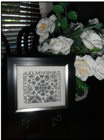
WMN:QU - Quaker Samplings (over one thread)