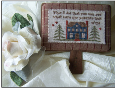
WMN:BHPRIMER - Blue House Needle Primer