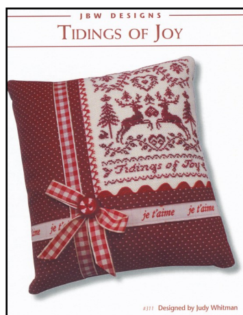
Design Title: Tidings of Joy Design Code: JBW 311 Price: $21.50