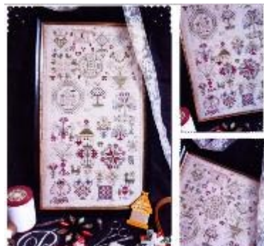
GR : SF Sampler Frisien 1750