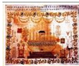
GR : AL