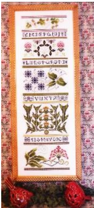
ROSE : TB