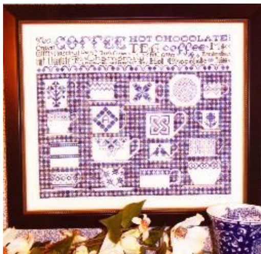
ROSE : CHINA China Blue Sampler $29.00