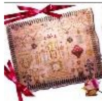
GR : AA