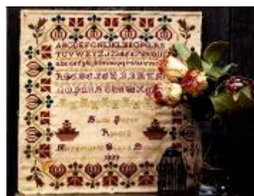
GR : SP Susie Pierce 1889