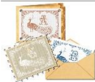
GR : INITIALS Initiales au Paon : $32.50