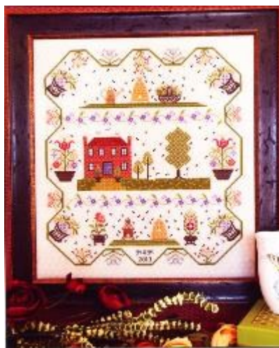
ROSE : HIVES Berkshire Bee Hives $29.00