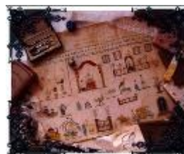
GR : AS