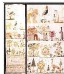
GR : ATS