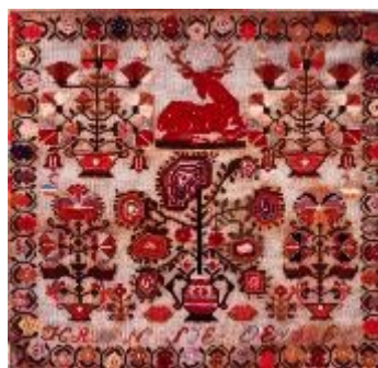
GR : RDEER The Red Deer Sampler 1861 - 1866