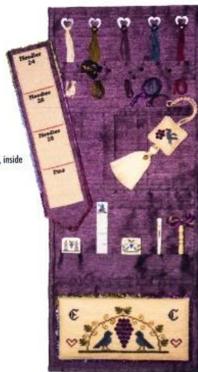
Huswif and needleroll, closed