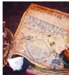
GR : EP Elizabeth Precious 1817