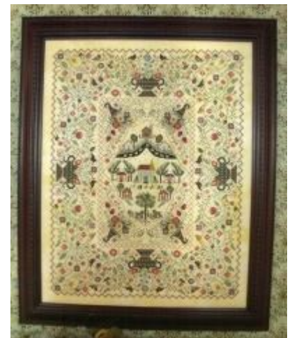
ROSE : INSPIRE Inspiration