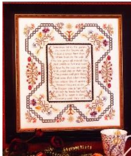
ROSE : GFLOWERS The Garden Flowers