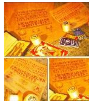
GR : SAV Sampler aux Vasques