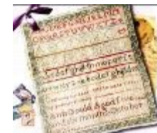
GR : AG