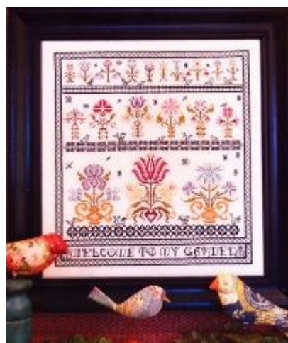
ROSE : GARDEN Welcome To My Garden $27.50