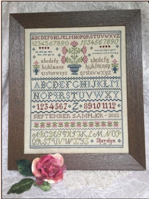
Sherdyn's September Sampler - 2022