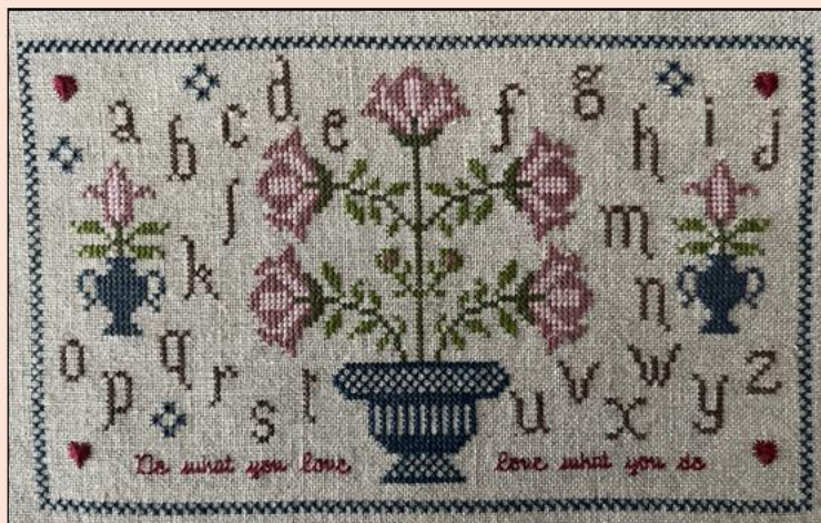
Do What You Love