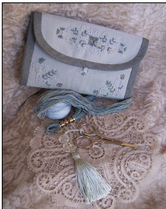
Design Title: Hem Your Blessings Poche Design Code: BARB 1014 Price: $25.00

I'm stitching this piece in a colourway that is 'out of my comfort zone' but surprisingly am enjoying the challenge of working with a different colour palette. Here is a pic of the original design and my current one -