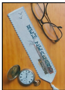
Red Billed Gull