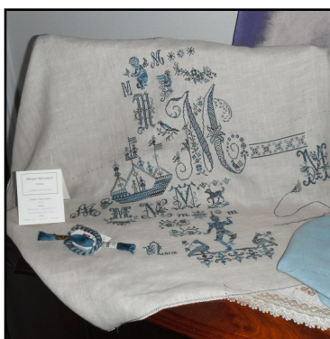
M : Margot - Hastings

The latest two letters that have been completed are -