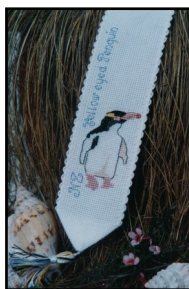
Yellow Eyed Penguin