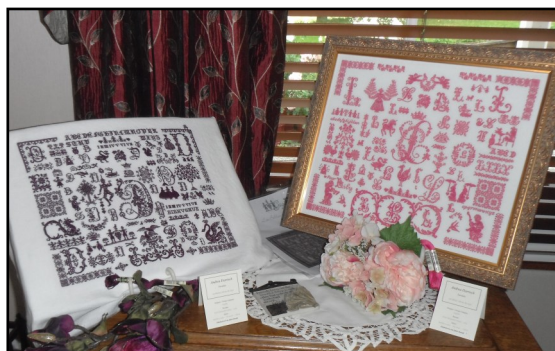
L & D : Andrea - Taradale (over one fabric thread)