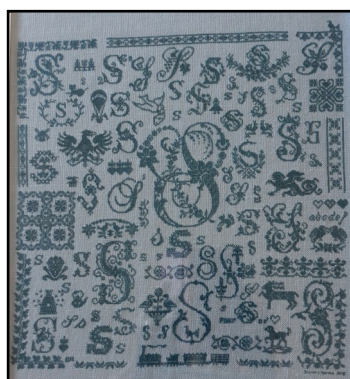
S : Sharon - Napier (over one fabric thread)

The latest two letters that have been completed are -