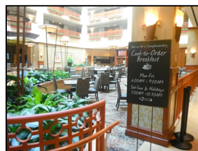
Pictured - Embassy Suites Hotel exterior & looking towards the breakfast area from the hotel lobby

As mentioned in my last blog, my stitching project was to stitch more of my third version of my 'Family Quaker Sampler' - over one thread on 32 count Permin linen (White Chocolate) with a Simply Shaker Sampler Thread (Endive). I didn't get it finished as from time to time I stitched other pieces - but more about those pieces later in this blog.