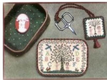
MN 503 In The Garden

Accessories: The little rulers that are included in the ruler pocket designs by Milady's Needle are able to be purchased. Limited supplies at the Gallery. OCD:RULE: 6" Brass Ruler $18.00 each