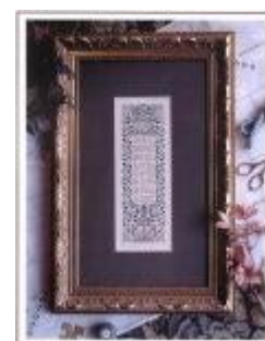
DT : Glory Morning Glory

The International Needlework Trade Show at Nashville has recently been held and all the new designs from JBW Designs , The Sweetheart Tree and With My Needle have arrived at the Gallery. As always, they are just lovely. Details next month.