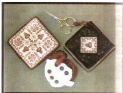
MN 502 Milady's Acorn Box

MN 503 - In the Garden: An Adam & Eve sampler design for a scissors fob and for the lid of another little box. As above, included with the design is a dear little, very strong, embossed card box, fabric and cotton sampler threads. Kit: $61.00