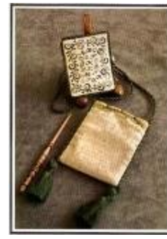
MN 501 Cottage Garden Stitcher's Pocket

MN 502 - Milady's Acorn Box: Acorns are the design theme for this little box lid and scissors fob. Included with the design is a dear little, very strong, embossed card box, fabric and silk threads. Kit: $61.00