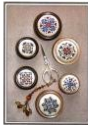
MN 048 Precious Pin Cushions