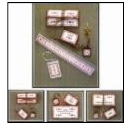
MN 057 ABC Come Stitch With Me

MNK:NP - Needles & Pins: A lovely rectangular pin keep designed to be worn about the neck on a long twisted cord. Design is of two friends dressed in their crinoline dresses below the verse, "Needles and pins, Needles and pins, When a girl marries, Her trouble begins". Included with the design are the silks for stitching, a 'card' needlebook, needle and fabric. Kit: $47.50