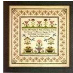
MN 054 Winter Is Past