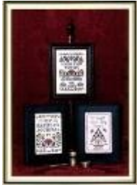
MN 023 Needlework Memories

MN057 - ABC Come Stitch With Me: Designs for a ruler insert, floss tag, stitching pocket, needlebook and a scissors fob. Design only: $43.50