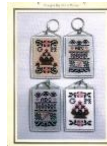
MN 024 More Sampler Key Chains