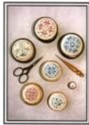
MN 046 Quaker Pin Cushions