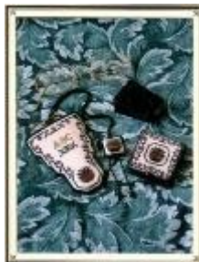
MN 005 Strawberries Rule Accoutrements