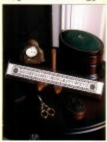
MN 003 Strawberries Rule

MN 029 - My Little Quakers Ruler Pocket: Another design in which to keep a lovely 6" brass ruler. This time, Quaker motifs. Design & Ruler: $28.50