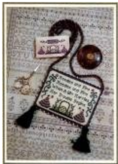
MNK : NP Needles & Pins

MN 501 - Cottage Charm Stitcher's Pocket: Create a little needlebook that also houses your scissors in a little pocket. Cover of the needlebook features a sampler design on the front and the pocket for the scissors is created with gorgeous 'sampler' printed fabric. This fabric is also used for the lining of the needlebook and there is sufficient fabric to create a little bag in which to keep your needlebook. Included with the design is the silk thread, linen fabric and the printed 'sampler' fabric for the lining and bag. Kit: $61.00