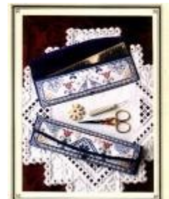
MN 029 My Little Quaker Ruler Pocket

MN 023 - Needlework Memories: Three little sampler designs that can be finished as framed pieces, attached to a cushion to give to a friend or, as originally designed, as the cover of a journal to record all the pieces you have stitched*. Parchment pages for your journal are included. Design: $31.00