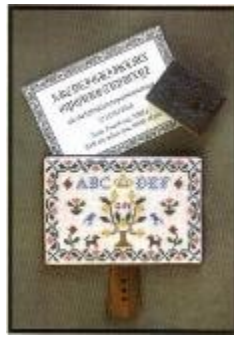
MNK 004 A Schoolroom Primer