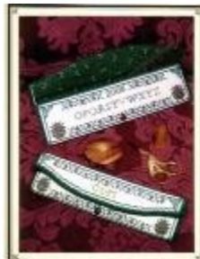
MN 011 My Little Strawberries Ruler Pocket