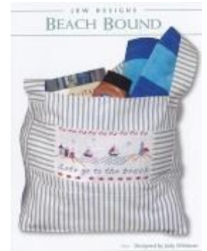
JBW 264 Beach Bound