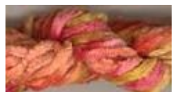
028 - Peach Melba (3)

Silken Chenille: Code: SC • 100% Silk Chenille • 20 yards per skein • $12.50 per skein