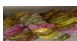
059 - Gilded Lavender (1)

The Thread Gatherer - deleted colours in threads continued: