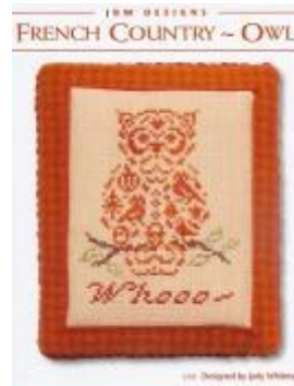
JBW 260 French Country ~ Owl

JBW 264 - Beach Bound: A design to stitch onto your beach bag. Little sailing boats on the waves, a lighthouse and old-fashioned beach changing sheds, with the words, "Let's go to the beach" underneath. Design: $10.00