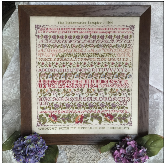
GR : BS The Biedermeier Sampler 1864 $ 55.00