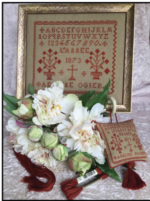
GR : SA Sweet Adeline $ 29.50