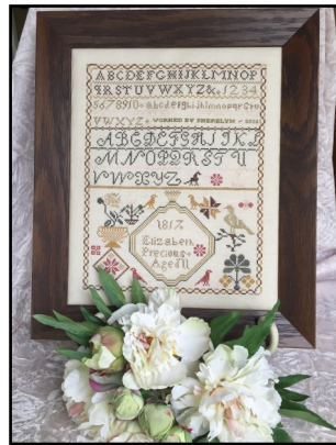
GR : EP Elizabeth Precious 1817 $ 36.50