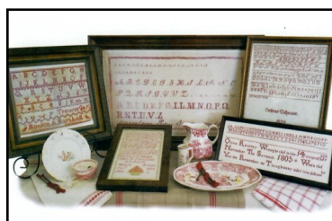
Antique Sampler Collection II