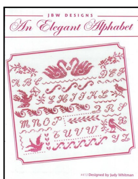
An Elegant Alphabet