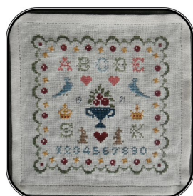
Cherry Ripe Sampler