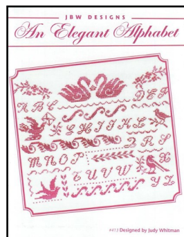
An Elegant Alphabet