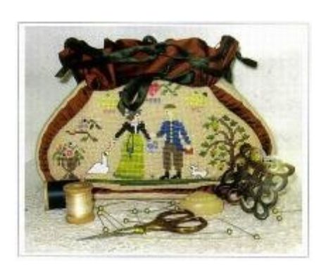
GPA:LOVE Everlasting Love Italian Purse