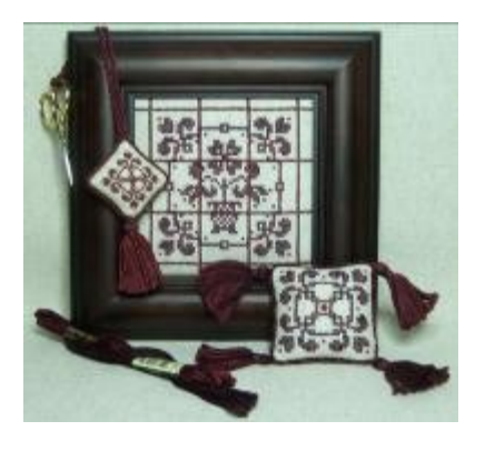
This design / pieces stitched with: Thread - Sampler Thread : Currant (0312) Fabric - Floba : 25 count Natural/Raw (#53)

Note: The fabric was stitched with DMC 902 (before stitching the design) to create the squares. Also, created a pincushion by stitching the fob pattern over two threads.