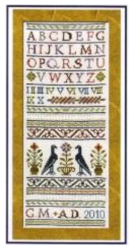
GPA:TOKENS Tokens From Italy