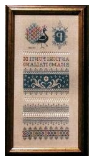
GPA:PEACOCK Assisi Peacock Sampler