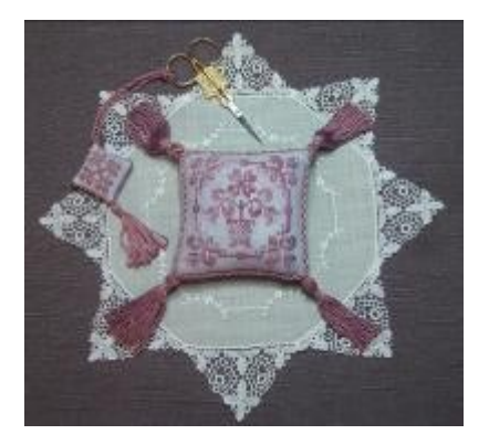
This design / pieces stitched with: Thread - Silken Pearl #10 021 - Sweet Peas Fabric - Belfast Linen: 32 count Dusk (#409)