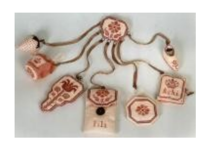
GPA:SOFIA Queen Sofia's Sewing Bag & Chatelaine (The Chatelaine Accessories included with the Sewing Bag design)