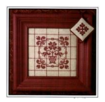
Original design / pieces stitched with: Thread - DMC 902 Fabric - Newport Linen : 28 count Victorian Red & Raw

Really pleased with the results. As you can see, I stitched the design twice. And it's amazing to see the different looks. Each lovely in their own way.