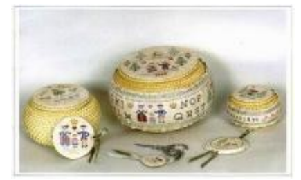
GPA:SET 3 Baskets Stitcher's Sewing Set