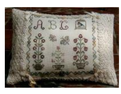
GPA:BIRD Blue Bird Garden Pillow