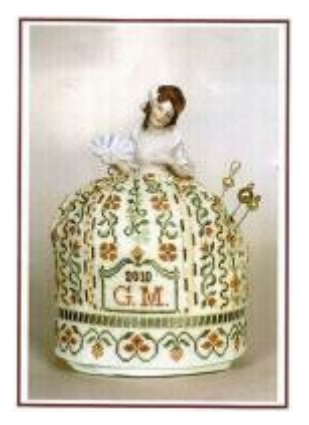
GPA:FLAPPER A Flapper Doll Pincushion