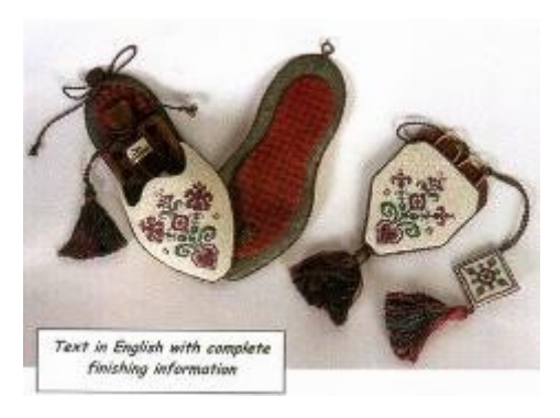
GPA:XMAS Christmas Sewing Set