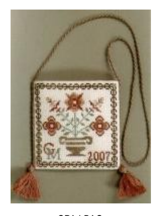
GPA:I-BAG Isotta's Sweet Bag