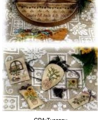
GPA:Tuscany My Tuscany: A Shaker Box In Italy

Another lovely design which is currently 'out-of-stock' but will be available soon, is one that I am at present stitching. It is a decorative purse. Design is of a pair of peacocks standing on a tree branch.