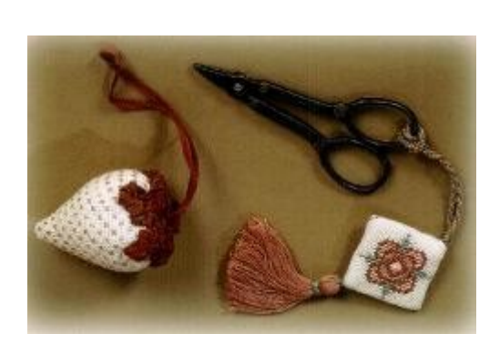
GPA:I-FOB Isotta's Strawberry Pincushion & Scissors Fob