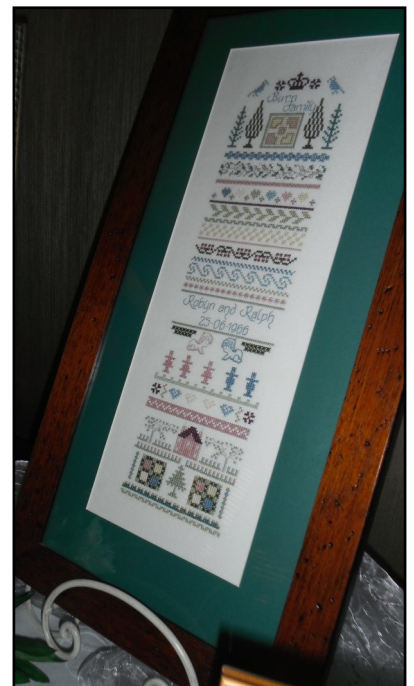
Wedding Celebration Robyn - Otane

Needlework kit purchased there at that time