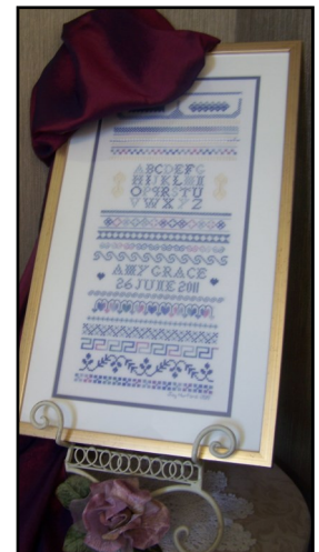
Birth Sampler for a granddaughter Joy - Havelock North