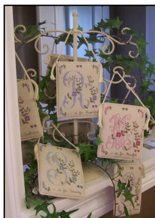
The Alphabet Series : Barberry Row Individual Letters of the Alphabet