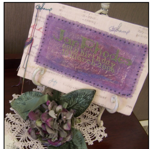
Celebration of a 60th Birthday

Same design format but different / individual elements and colours chosen