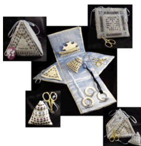
DESIGN - KELM:GARDEN Walled Garden Etui $ 39.50

Designs & Kits: A few more designs and kits recently purchased from miscellaneous designers -