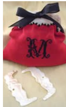
KELM: PURSE $ 27.50 Pair

May be used for the top of a stitched purse or as Bellpull ends