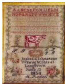
DESIGN - NWP:ISA Isabella Johnstone Sampler $ 31.00