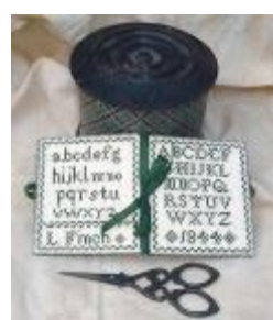
KIT - MS:FINCH L. Finch 1844 - An Exact Reproduction $ 42.50