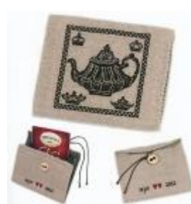
KIT - HC:K187 Teabag Holder $ 69.00