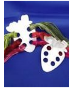
Strawberry Thread Keep