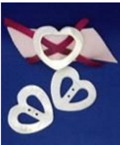
KELM: BUCKLE $ 7.50 each

Miscellaneous: A few of the miscellaneous items from Kelmscott Designs -